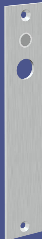
LONG STRIKE (YNL173G)